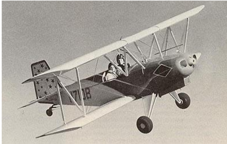
The newest biplane from Wichita is Dave Blanton's Wichawk, a side-by-side two-seater that is simple to build and easy to fly.

The maker lists fuel tanks and metal wing ribs as the only preformed parts available; but, because the aircraft structure is so simple, few others are needed.